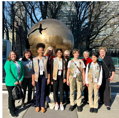
Zontians and Z club members at CSW68 in New York City.

Moreover, recent “developments” in many countries have raised significant concerns. There has been a troubling rise in anti-DEI and anti-gender movements, which threaten to roll back the hard-won gains in gender equality. These movements undermine the progress we have made and pose a serious challenge to achieving a just and equitable society. Please read our statement on this matter here: Zonta International remains steadfast in mission to build a better world for women and girls.